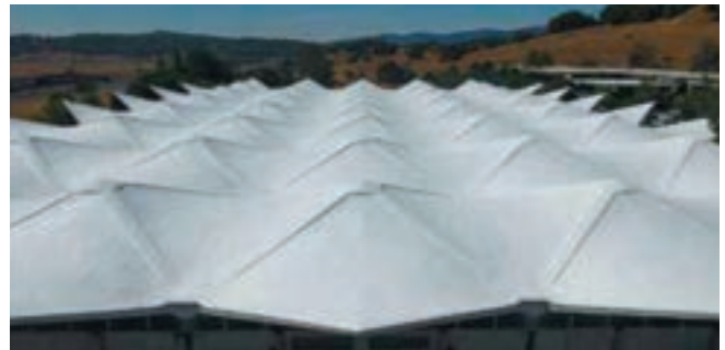
SPF roof installed over an unusual roof design at Birkenstock headquarters in Novato, CA.