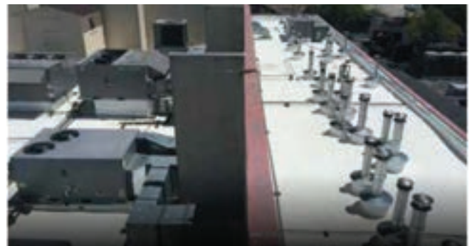
SPF provides self-flashing around all deck-mounted equipment and penetrations for this industrial manufacturing facility.