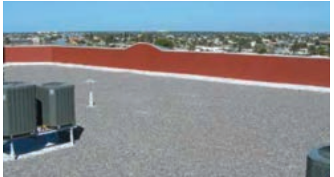
Application of SPF followed by an aggregate covering.