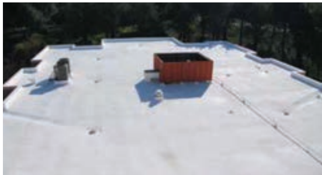
SPF roofing applied promotes enhanced drainage.