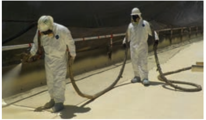
Application of SPF on a low-slope roof.

Elastomeric coatings are typically specified by the foam supplier as part of a SPF roof system and can include acrylic, silicone, butyl rubber, polyurethane and polyurea.