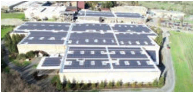
SPF roof with photovoltaic panels at the Rodney Strong Vineyards in Healdsburg, CA.