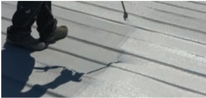
Application of SPF over a metal roof followed by an acrylic coating.