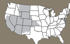
Algae resistance available in areas shown in white.

Tru PROtection® Non-Prorated Limited Warranty* Period 10 Years